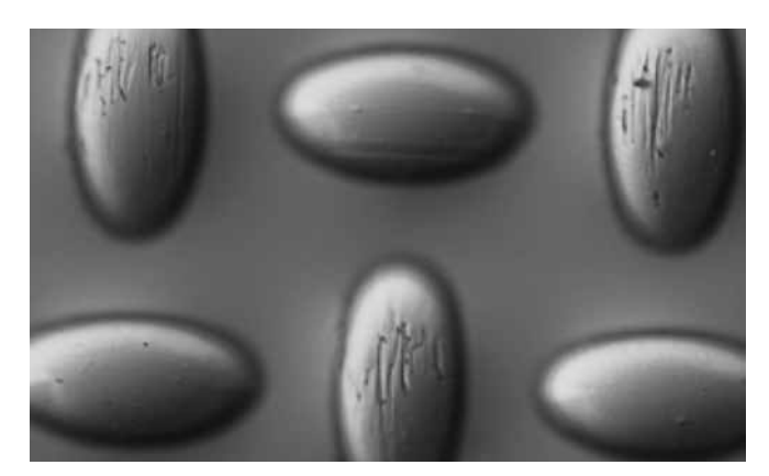
Standard polyester mesh 120/305-34W after 5.000 prints