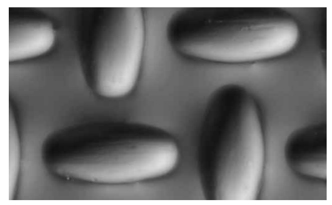
SEFAR® PA 120/305-35W after 5.000 prints

SEFAR® PA properties leave no wish unanswered: High elasticity; excellent abrasion resistance; very good adhesion of the stencil material and – in yellow – unsurpassed UV-A light undercutting protection.