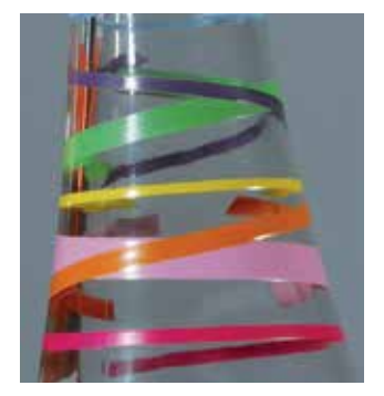
High density and sharp contours with SEFAR® PA 100/255-38Y