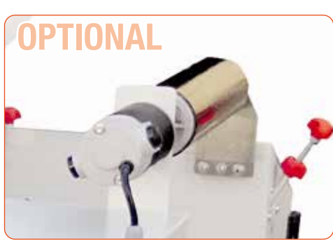
Digital HotStamp® module: Multifunctional devise that allows metallic foiling, varnishing and spot varnishing.